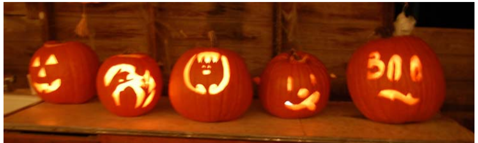
Glowing pumpkins cast their unique faces about the chicken house as darkness falls. It was great day!