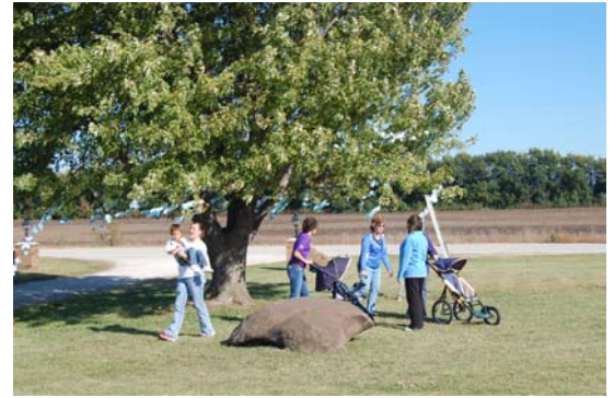
The Blue Ribbon Tree showed the number of children in foster care in Region 4.

After an afternoon of free snow cones and candy from the piñata, the kids still managed to eat quite a few hot dogs and treats at the picnic. The hayrack ride was quite an adventure too, with some spooks popping out from the trees along the field and scaring the riders. All in all, it was a great day of old fashioned family fun. KFAPA would like to thank those who attended and participated, as well as the sponsors of the event, for making the day so memorable.