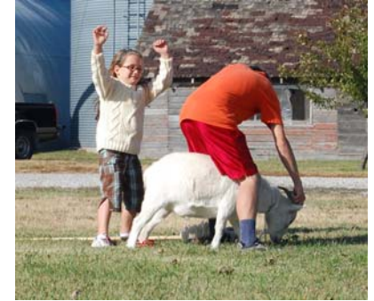
Left: The Red Ribbon Tree depicted the number of foster families in Region 4. Right: A participant of "Tie the Ribbon on the Goat's Tail" throws up her hands in true cowgirl fashion to stop the timer and win a prize.